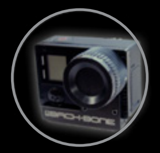
GO PRO HERO 4

Allows the user to control the iris to give a much deeper depth of field.