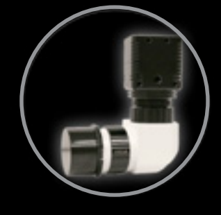
HD LIVE VIDEO CAMERA

Easily attach specific Sony, Canon, or Nikon DSLR camera directly to the microscope for high quality, razor sharp images. DSLR adapter sold separately.