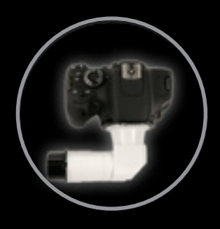
DSLR CAMERA ADAPTER

Hero 4 has been specially modified so you can select the right setting for any given shot or capture 1080P video.