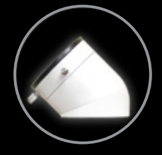
EXTENDER ROTATION DEVICE

Specially designed to create the highest quality imagery. The port contains a 50/50 side for digital and 80/20 for video. Optional 50/50-50/50 available.