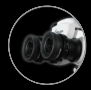
WIDE-FIELD EYEPIECES Standard 10x and 12.5x with eye

The inclinable head allows for a full 0-220° rotation. Seiler offers: 0-220° inclinable, straight, and 45° inclined binoculars.