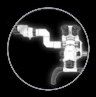
ASSISTANT TEACHING HEAD

Allows a second user to view the same procedure.